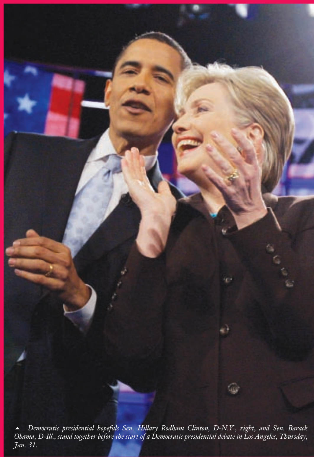
▲ Democratic presidential hopefuls Sen. Hillary Rodham Clinton, D-N.Y., right, and Sen. Barack Obama, D-Ill., stand together before the start of a Democratic presidential debate in Los Angeles, Thursday, Jan. 31.

Over the weekend, in the final days leading up to Super Tuesday,